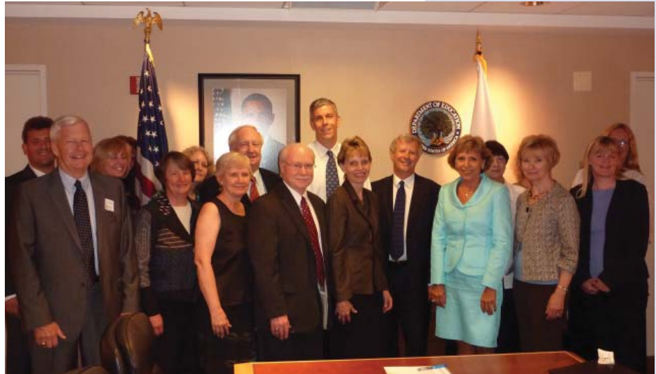
The Executive Council and Secretary of Education Arne Duncan at the Department of Education.